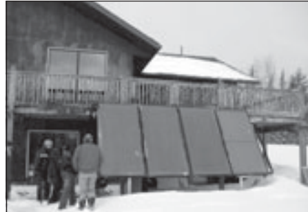
A home using solar panels near Thunder Bay

The SREC is planning for a similar tour in the fall, both for fund-raising and to raise public awareness of the innovative homes that exist in the community. To find out more about the SREC, visit: http://my.tbaytel.net/ccampbel/srec.html .